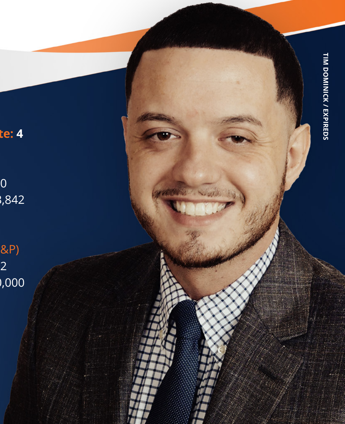
TIM DOMINICK / EXPIREDS